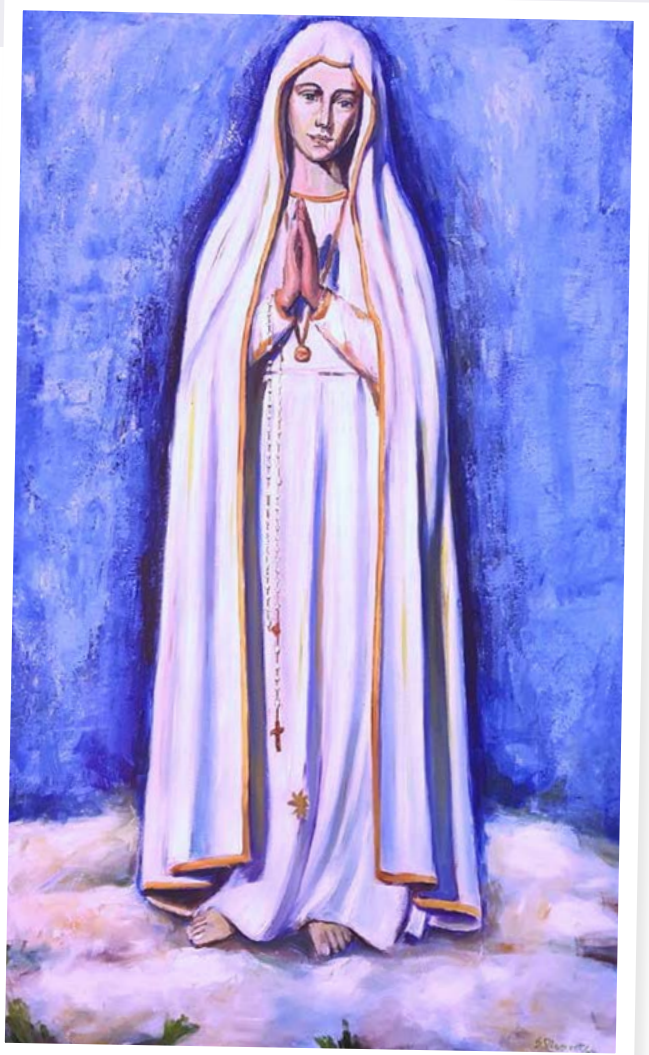
This painting of Our Lady of Fatima is in the Shrine of the Sorrowful Mother in St. Agatha, Ontario.

Generosity is at the heart of the Christian life, just as it is at the heart of the Gospel. For it is often through our generosity that we are able to bring the love of God to others in a tangible way. Your love offerings have truly made a difference in our call to mission in Building the Church of the Home and Building the Church of the Poor. Thank you for living our mission and vision. Please click the link below to view our first quarter financial report.